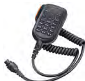
Keypad Microphone SM19A1