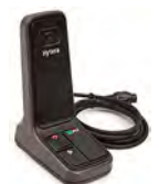
Desktop Microphone SM10A1