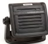
External Speaker SM09D1