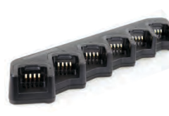
MCU Multi-Unit Charger (For Thick Battery) MCA08