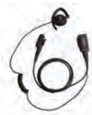
Earset Swivel EHN17