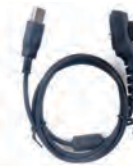
Programming Cable (USB Port) PC38