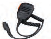
Remote Speaker Microphone (IP57) SM18N2