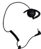
EHS17 ① Receive-Only Adjustable Earhook with Swivel Speaker