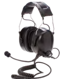
ECN21 Heavy-duty noise-cancelling headset with PTT and boom microphone