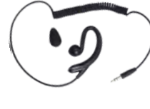
EH-01 Receive-Only C-Style Earloop