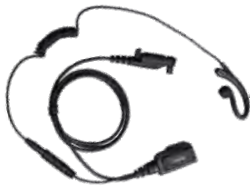
EHN26 C-style Earpiece with microphone and in-line PTT button

External earpieces and microphones that attach directly to the radio