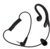
EHS18 ① Receive-Only C-style Earpiece