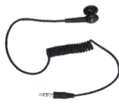
ES-01 Receive-Only Earbud