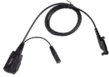
ACN-02 Mic and PTT button with VOX and 3.5mm Jack Receive-only Earpiece (IP54)

External earpieces that are used in combination with the ACN-02