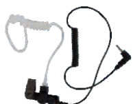
EAS03 ① Receive-Only Transparent Acoustic Tube Earpiece