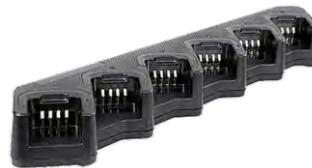
MCL32 6-Radio Multi-Unit Charger