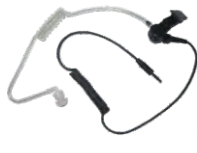
ES-02 Receive-Only Transparent Acoustic Tube