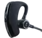
ESW08 Bluetooth Earpiece with PTT button and microphone