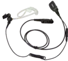
EAN24 Transparent Acoustic Tube Surveillance Earpiece with microphone and in-line PTT button