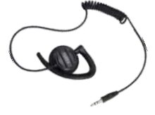
EH-02 Receive-Only Swivel Earpiece