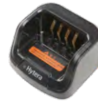
CH10L27 Drop-In Single Unit Charger