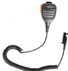
SM26N2 ① Palm PTT Mic with Speaker and emergency button (IP54)