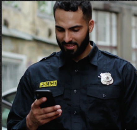
Officers can upload evidence from a WiFi device through the vehicle's LTE connection.