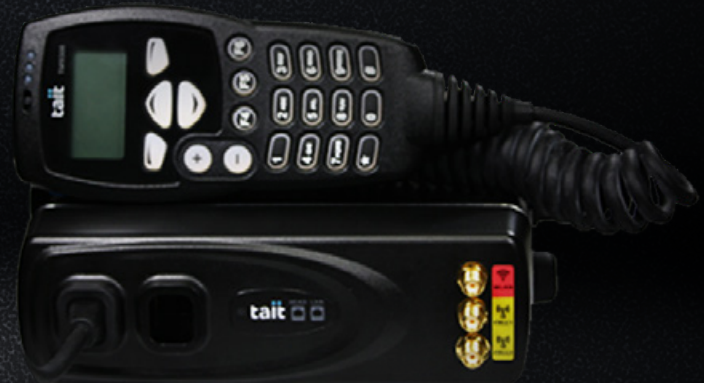
Handheld Control Head option puts all functions in the palm of your hand and allows radio body installation anywhere in the vehicle.