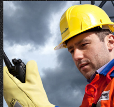
Utility workers can automatically be alerted to advancing lightning storms.