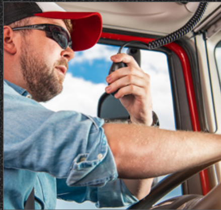
Transport drivers can use broadband to stay in touch with dispatch through radio dead zones.