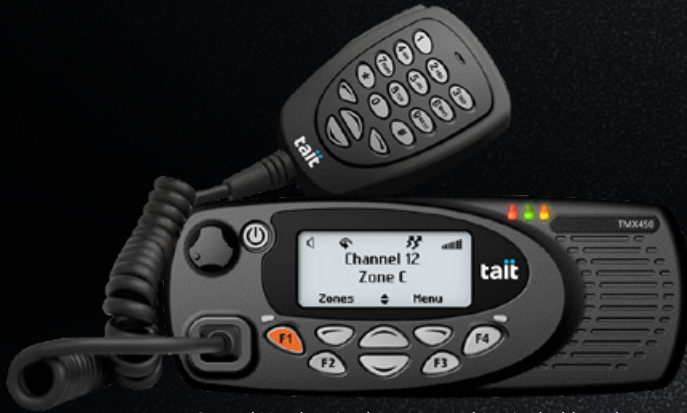
Large Control Head option keeps everything in dashboard view and allows radio body installation anywhere in the vehicle.