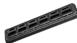
MCL35-S Multi-Unit Charger for Radios and Batteries