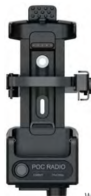
CK10 CAR KIT

The CK10 Car Kit is a rugged vehicle mounting assembly that enables the PNC380S to be installed on a vehicle dashboard and comply with DOT requirements. The Car Kit allows the PNC380S to be easily removed for handheld job-site communications. The Car Kit includes a locking bracket, an on/off power button, and ports for external speakers, microphones, and push-to-talk buttons. The CARKIT also functions as a docking charger for the PNC380S.