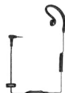
EHS30 Earpiece with in-line PTT & C-Earset