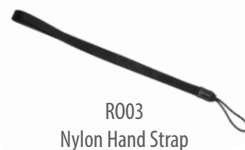
R003 Nylon Hand Strap