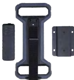
POA207 Protective Case with Hand Strap BRK37 Protective Case with Mounting Bracket BC39 Belt clip for use with POA207