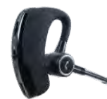
EHW08 Bluetooth Earpiece with PTT Button and Mic