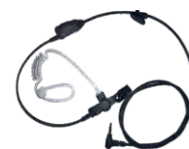
EAS07 Transparent Tube Earpiece with in-line PTT