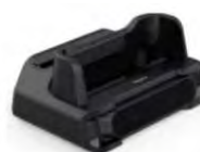
CH20L19 Desktop Charger